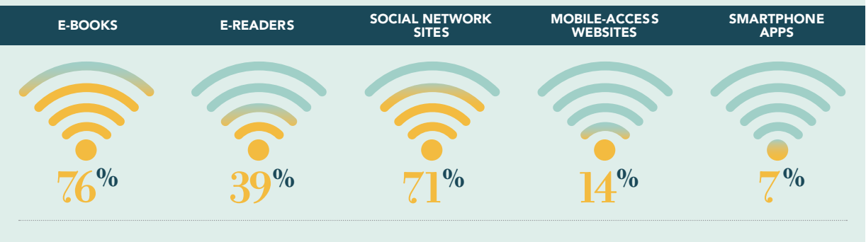
FIGURE A-2: U.S. PUBLIC LIBRARIES: TRENDS IN E-BOOKS AND E-ACCESS